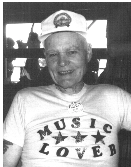
At Lady of the Lake Family Week

Reprint rights for the web have not been granted for this article. Sorry.