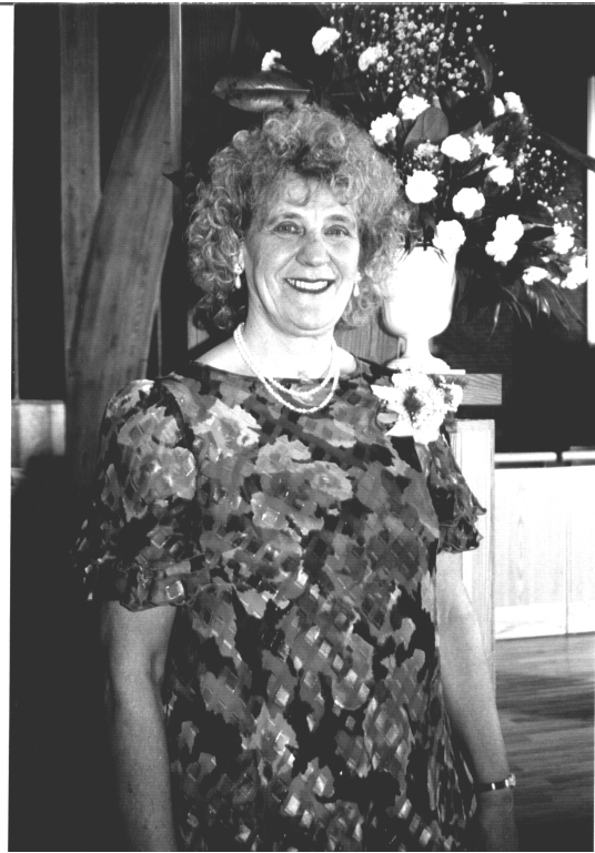
Ashville, North Carolina, 1994