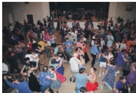
Dancing at the Snowball in Peterborough NH