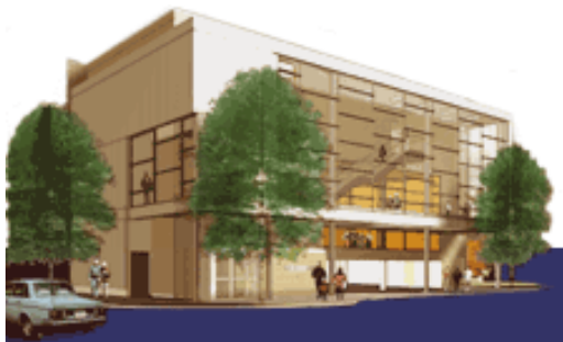
Springstep Center, Medford