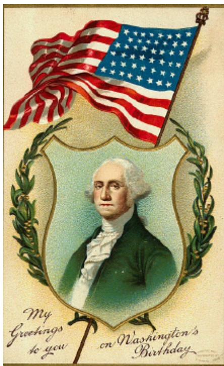
The Nominating Committee: Steve Moore and Beth Parkes

NEFFA is a non-profit organization run by volunteers. In addition to producing an annual Folk Festival, NEFFA runs a weekly contra dance, the Ralph Page Dance Legacy Weekend, and a series of family dances. NEFFA also supports various folk-related activities through its grants program.