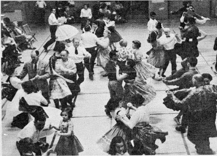
The festival is a great variety show of native costumes and general folk and square dancing, with champion callers, favorite fiddlers and fun for all.

A program of year-round events of the New England Folk Festival Association will be climaxed by the 19th annual New England Folk Festival to be held next Saturday from noon to 11 p.m. at the Lowell Memorial Auditorium. Let's promenade on down through the months with a look at some of the other activities.