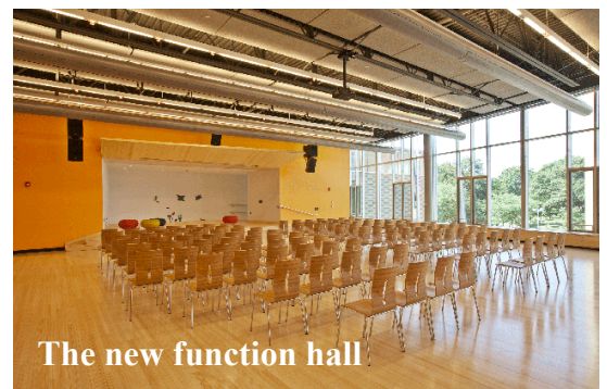
Cambridge 7 Architects