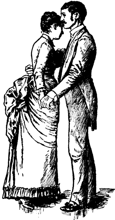
The proper way.